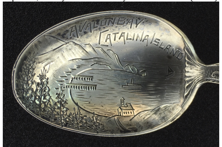
Caption 7, Variety 1 - "Avalon Bay Catalina Island" (C7-V1)

on J. Mayer & Bros. - Catalina themes "Tuna"